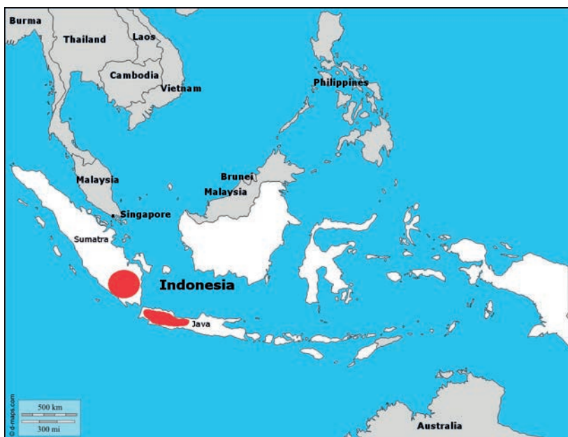
Fig. 2 Map showing the distribution of Rafflesia patma indicated in red (© Sarah Cardinal according to Nais, 2001, map: http://d-maps.com , 2015).

The preservation of this species is a priority for Bogor Botanic Garden (BBG) in Bogor, Indonesia. Indeed, this species is especially rare and Nais (2001) indicates that its distribution is restricted to Sumatra, West Java, Central Java and that it has possibly occurred in Bali. But it seems that the species is now extinct in Sumatra and close to extinction in the other places (Meijer, 1997). Preservation of the species is also urgent due to its importance in local communities as an ingredient used in traditional medicine (Nais, 2001). Previous attempts by various teams to cultivate the plant have not been successful (Nais, 1999; 2001). These disappointing results were explained by a lack of information on its biology. In 2004 the BBG team began several projects dedicated to finding out the biology of this species with the ultimate goal of successfully cultivating it. The purpose of this paper is to present this research.