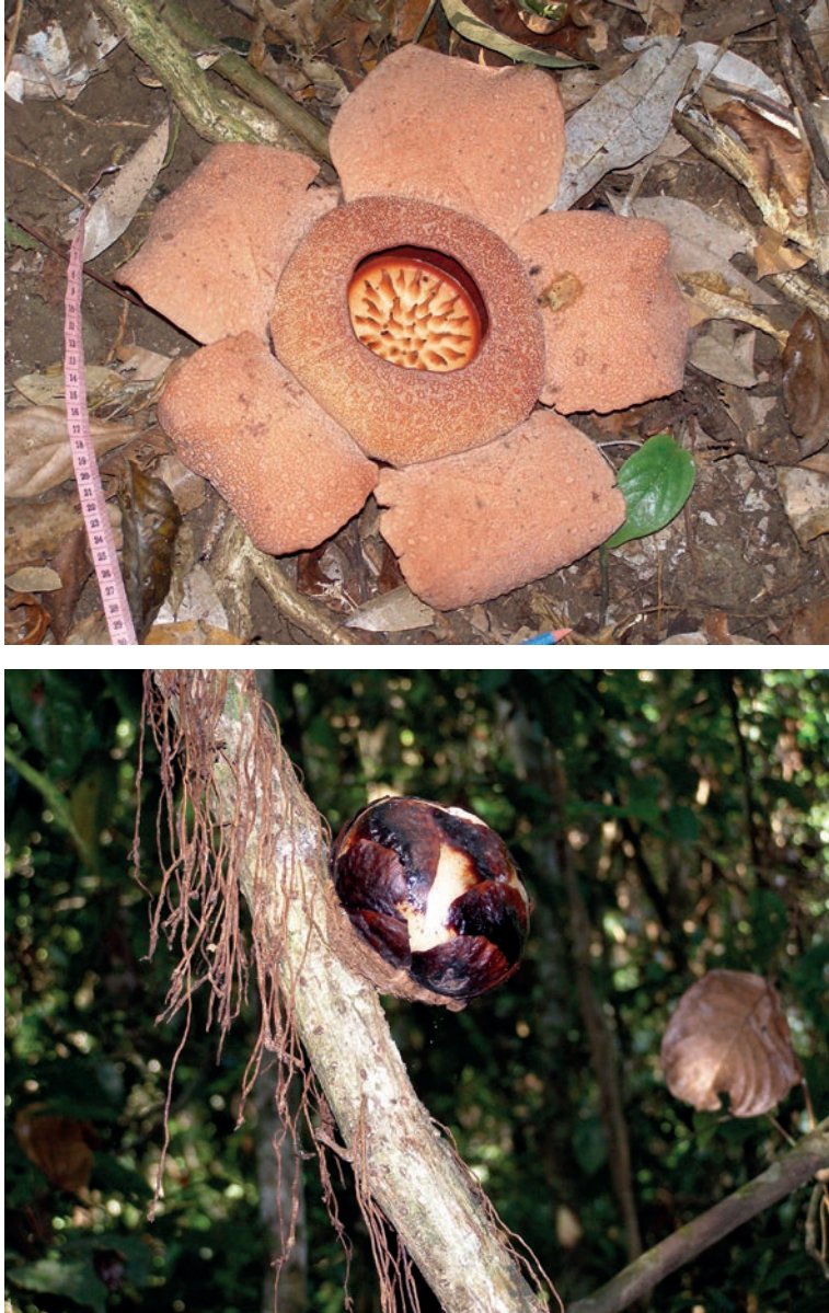
Fig. 1 Flower of Rafflesia patma on Tetrastigma root system (top) and of R. patma bud on aerial stem of Tetrastigma (bottom).

Rafflesia patma Blume (Fig. 1) was discovered in 1818 by C.L. Blume on Nusa Kambangan Island along the south coast of Java, Indonesia. Most of the localities of