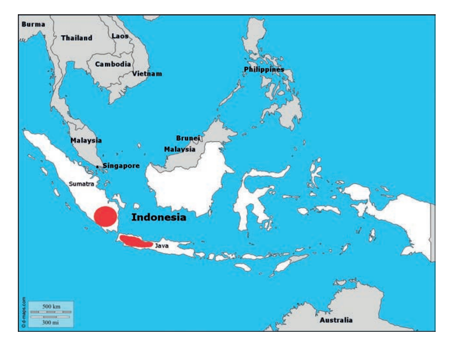
Fig. 2 Map showing the distribution of Rafflesia patma indicated in red (© Sarah Cardinal according to Nais, 2001, map: http://d-maps.com, 2015).

The preservation of this species is a priority for Bogor Botanic Garden (BBG) in Bogor, Indonesia. Indeed, this species is especially rare and Nais (2001) indicates that its distribution is restricted to Sumatra, West Java, Central Java and that it has possibly occurred in Bali. But it seems that the species is now extinct in Sumatra and close to extinction in the other places (Meijer, 1997). Preservation of the species is also urgent due to its importance in local communities as an ingredient used in traditional medicine (Nais, 2001). Previous attempts by various teams to cultivate the plant have not been successful (Nais, 1999; 2001). These disappointing results were explained by a lack of information on its biology. In 2004 the BBG team began several projects dedicated to finding out the biology of this species with the ultimate goal of successfully cultivating it. The purpose of this paper is to present this research.