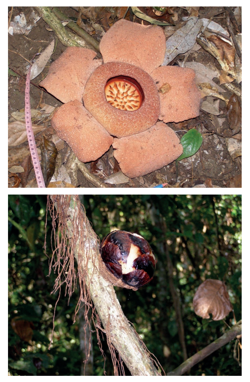
Fig. 1 Flower of Rafflesia patma on Tetrastigma root system (top) and of R. patma bud on aerial stem of Tetrastigma (bottom).

Rafflesia patma Blume (Fig. 1) was discovered in 1818 by C.L. Blume on Nusa Kembangan Island along the south coast of Java, Indonesia. Most of the localities of